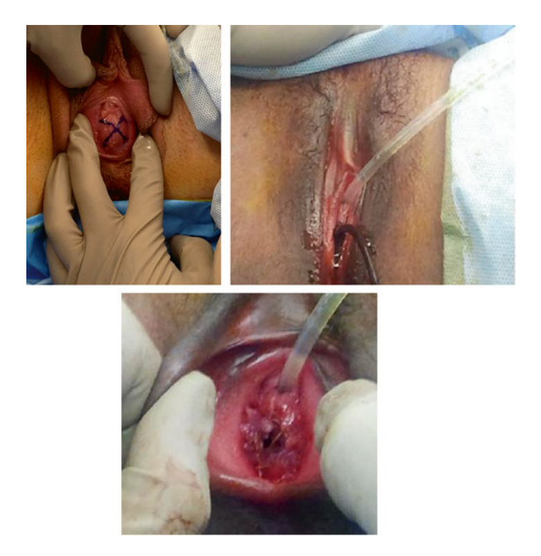
Fig. 1.2 (a) demarcation of the hymenal tissue outlines the cruciate incision in the hymenal tissue, (b) evacuation of hematocolpos, and (c) circumfrential interrupted sutures reapproximate the hymenal periphery to the vaginal mucosa

A hymenotomy is the appropriate treatment for imperforate hymen. Foley catheter was inserted to empty the bladder and a cruciate hymenal incision allowed for decompression of the large hematocolpos with expression of copious thick brown blood (see Fig. 1.2a, b). Circumferential interrupted sutures placed to reapproximate the vaginal mucosa to the hymenal periphery was performed by a gynecologist experienced in the field of congenital reproductive anomalies (see Fig. 1.2c).