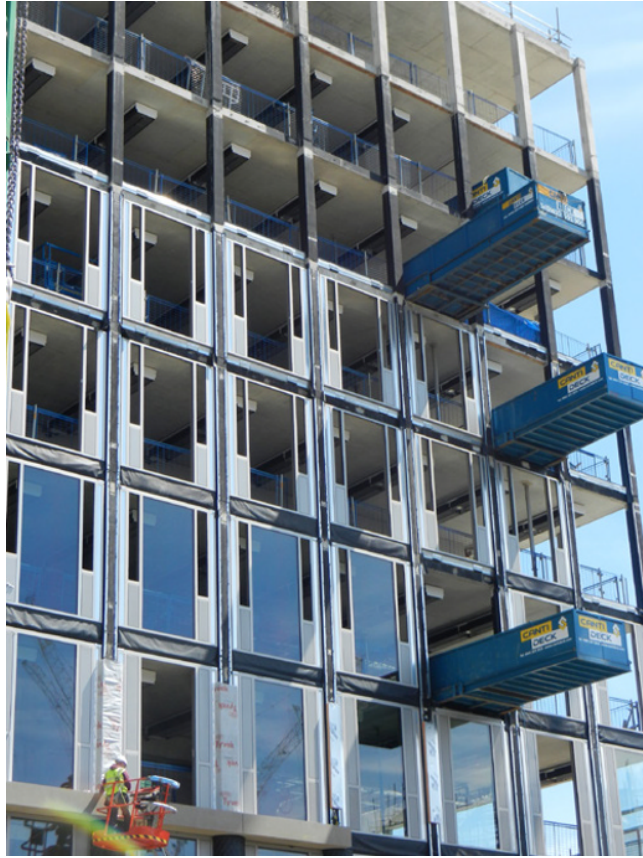
Photograph 1.1 Framed building under construction.