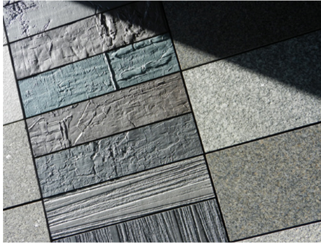
Photograph 1.2 Artificial stone made entirely from recycled rubber tyres (left of picture, rough texture) adjacent to natural stone (right of picture, smooth texture).

subcontractors, will have their own attitude to new products. Some are keen to use new products and/or new techniques, while others are a little more cautious and tend to stick to what they know. Whatever one's approach, it is important to keep up to date with the latest product developments and to investigate those products and methods that may well prove to be beneficial. Maintaining relationships with product manufacturers is one way of achieving this; indeed we would urge readers to visit manufacturers and talk to them about their products. This should be balanced against independent research reports relating to specific or generic product types.